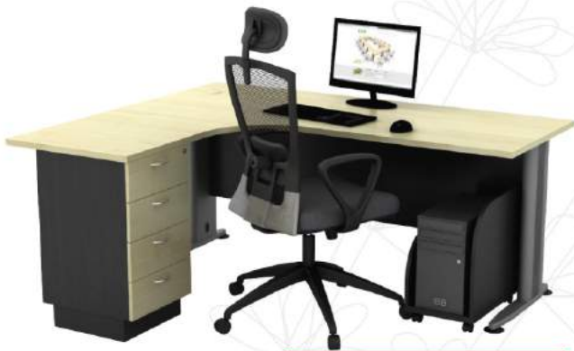
TL 1815-4D(L) + YCPU