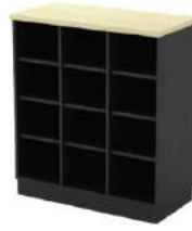
PIGEON HOLE LOW CABINET T-YP 9 800W x 400D x 910H