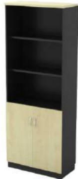
SEMI SWINGING DOOR HIGH CABINET T-YOD 21 800W x 400D x 2110H