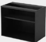
OPEN SHELF LOW CABINET (W/O TOP AND BASE) YO 863 796W x 430D x 630H YO 963 896W x 430D x 630H