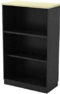
OPEN SHELF MEDIUM CABINET T-YO 13 800W x 400D x 1310H