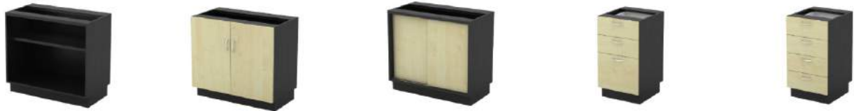
OPEN SHELF LOW CABINET (W/O TOP) YO 872 796W x 430D x 725H YO 972 896W x 430D x 725H SWINGING DOOR LOW CABINET (W/O TOP) T-YD 872 796W x 446D x 725H T-YD 972 896W x 446D x 725H SLIDING DOOR LOW CABINET (W/O TOP) T-YS 872 796W x 430D x 725H T-YS 972 896W x 430D x 725H FIXED PEDESTAL 2D1F (W/O TOP) T-YHP 3 396W x 446D x 725H FIXED PEDESTAL 4D (W/O TOP) T-YHP 4 396W x 446D x 725H