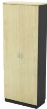
SWINGING DOOR HIGH CABINET T-YD 21 800W x 400D x 2110H