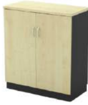
SWINGING DOOR LOW CABINET T-YD 9 800W x 400D x 910H