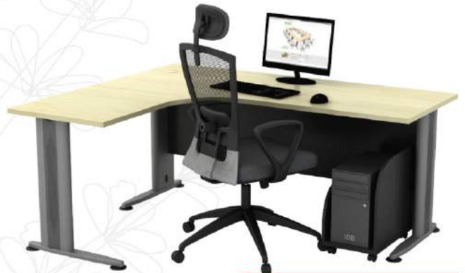
TL 1815(L) + YCPU