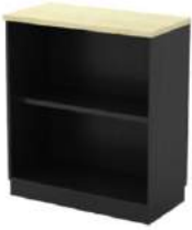
OPEN SHELF LOW CABINET T-YO 9 800W x 400D x 910H