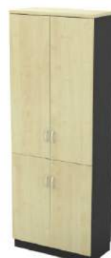
SWINGING DOOR HIGH CABINET T-YTD 21 800W x 400D x 2110H