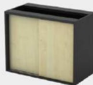
SLIDING DOOR LOW CABINET (W/O TOP AND BASE) T-YS 863 796W x 430D x 630H T-YS 963 896W x 430D x 630H