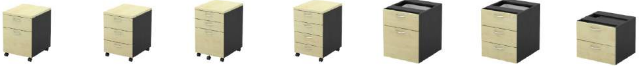
MOBILE PEDESTAL 1D1F T-YM 2 400W x 480D x 560H MOBILE PEDESTAL 3D T-YM 3 400W x 480D x 560H MOBILE PEDESTAL 2D1F T-YMP 3 400W x 480D x 620H MOBILE PEDESTAL 4D T-YMP 4 400W x 480D x 620H FIXED PEDESTAL 1D1F T-YH 2 396W x 468D x 480H FIXED PEDESTAL 3D T-YH 3 396W x 468D x 480H RETURN DRAWER 2D T-YRD 2 396W x 376D x 340H