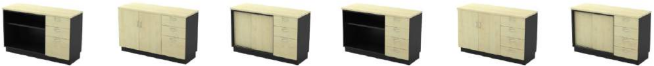
OPEN SHELF + FIXED PEDESTAL 2D1F T-YOP 7123 1200W x 450D x 750H SWINGING DOOR + FIXED PEDESTAL 2D1F T-YDP 7123 1200W x 450D x 750H SLIDING DOOR + FIXED PEDESTAL 2D1F T-YSP 7123 1200W x 450D x 750H OPEN SHELF + FIXED PEDESTAL 4D T-YOP 7124 1200W x 450D x 750H SWINGING DOOR + FIXED PEDESTAL 4D T-YDP 7124 1200W x 450D x 750H SLIDING DOOR + FIXED PEDESTAL 4D T-YSP 7124 1200W x 450D x 750H