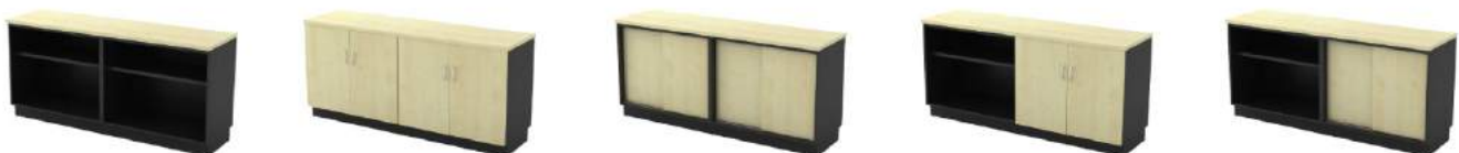
DUAL OPEN SHELF LOW CABINET T-YOO 7160 1600W x 450D x 750H T-YOO 7180 1800W x 450D x 750H DUAL SWINGING DOOR LOW CABINET T-YDD 7160 1600W x 450D x 750H T-YDD 7180 1800W x 450D x 750H DUAL SLIDING DOOR LOW CABINET T-YSS 7160 1600W x 450D x 750H T-YSS 7180 1800W x 450D x 750H OPEN SHELF + SWINGING DOOR LOW CABINET T-YOD 7160 1600W x 450D x 750H T-YOD 7180 1800W x 450D x 750H OPEN SHELF + SLIDING DOOR LOW CABINET T-YOS 7160 1600W x 450D x 750H T-YOS 7180 1800W x 450D x 750H