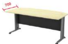
EXECUTIVE TABLE TMB 180A 1800W x 900D x 750H