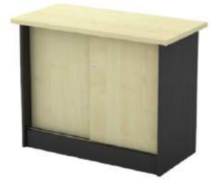
SLIDING DOOR SIDE CABINET T-YS 303 900W x 450D x 700H