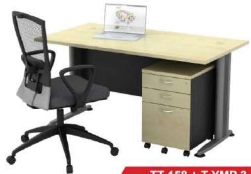
TT 158 + T-YMP 3