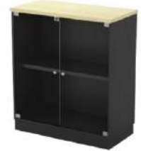
SWINGING GLASS DOOR LOW CABINET T-YG 9 800W x 400D x 910H