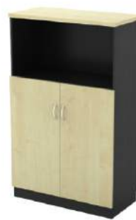
SEMI SWINGING DOOR MEDIUM CABINET T-YOD 13 800W x 400D x 1310H