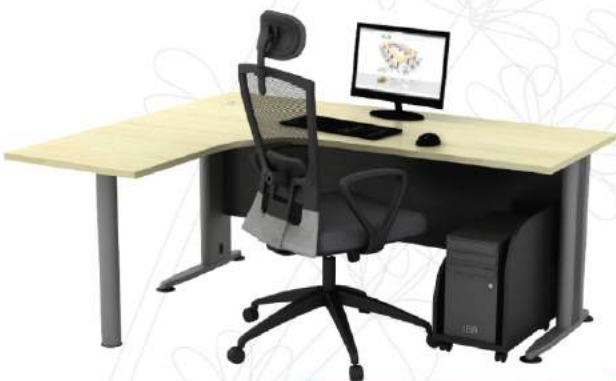
TL 1815-M(L) + YCPU