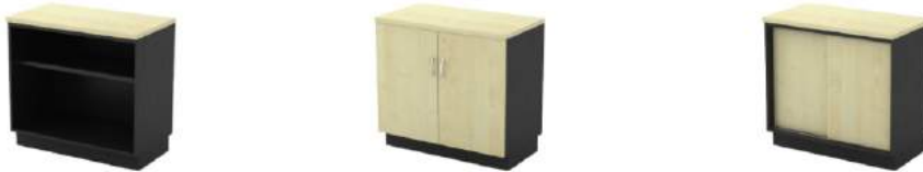
OPEN SHELF LOW CABINET T-YO 875 800W x 450D x 750H T-YO 975 900W x 450D x 750H SWINGING DOOR LOW CABINET T-YD 875 800W x 450D x 750H T-YD 975 900W x 450D x 750H SLIDING DOOR LOW CABINET T-YS 875 800W x 450D x 750H T-YS 975 900W x 450D x 750H