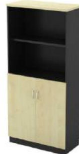
SEMI SWINGING DOOR MEDIUM CABINET T-YOD 17 800W x 400D x 1710H