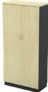
SWINGING DOOR MEDIUM CABINET T-YD 17 800W x 400D x 1710H