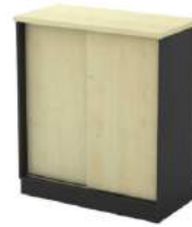
SLIDING DOOR LOW CABINET T-YS 9 800W x 400D x 910H