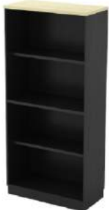
OPEN SHELF MEDIUM CABINET T-YO 17 800W x 400D x 1710H