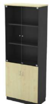
SWINGING GLASS DOOR HIGH CABINET T-YGD 21 800W x 400D x 2110H