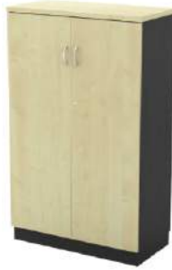
SWINGING DOOR MEDIUM CABINET T-YD 13 800W x 400D x 1310H