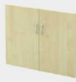
SWINGING WOODEN DOOR YFD 863(T) 790W x 628H x 16THK YFD 963(T) 890W x 628H x 16THK