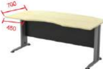
EXECUTIVE TABLE TMB 55 1800W x 900D x 750H