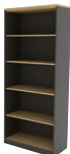
WK-MG-210-0 900W x 450D x 2100H MM