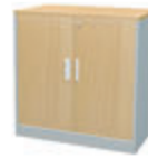
WK-ML-76-D1 750W x 450D x 760H MM