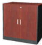
WK-MB-76-D1 750W x 450D x 760H MM