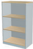
WK-ML-130-0 900W x 450D x 1300H MM