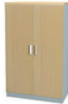
WK-ML-130-D1 900W x 450D x 1300H MM