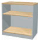
WK-ML-76-0 750W x 450D x 760H MM