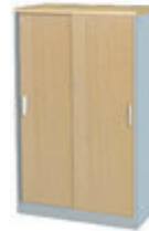
WK-ML-130-D2 900W x 450D x 1300H MM