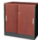
WK-MB-76-D2 750W x 450D x 760H MM