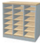
WK-ML-76-18P 750W x 450D x 760H MM