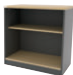
WK-MG-76-0 750W x 450D x 760H MM