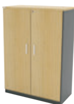
WK-MG-130-D1 900W x 450D x 1300H MM