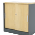
WK-MG-76-D2 750W x 450D x 760H MM