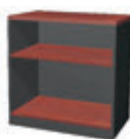
WK-MB-76-0 750W x 450D x 760H MM