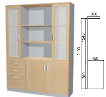
WK-ML-5 1500W x 450D x 2100H MM