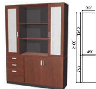
WK-MB-5 1500W x 450D x 2100H MM