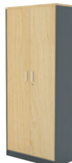
WK-MG-210-D1 900W x 450D x 2100H MM