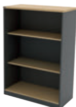
WK-MG-130-0 900W x 450D x 1300H MM