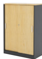
WK-MG-130-D2 900W x 450D x 1300H MM