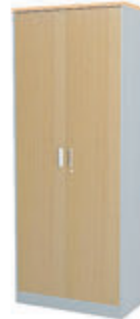
WK-ML-210-D1 900W x 450D x 2100H MM