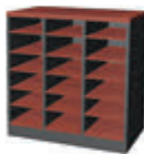
WK-MB-76-18P 750W x 450D x 760H MM