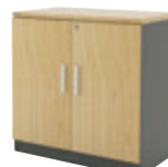
WK-MG-76-D1 750W x 450D x 760H MM