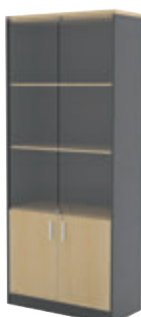
WK-MG-210-G1 900W x 450D x 2100H MM