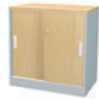
WK-ML-76-D2 750W x 450D x 760H MM