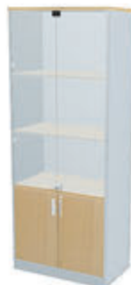
WK-ML-210-G1 900W x 450D x 2100H MM