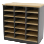
WK-MG-76-18P 750W x 450D x 760H MM