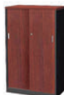
WK-MB-130-D2 900W x 450D x 1300H MM