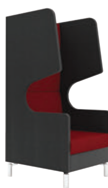
CH-HUME-01 755W x 730D x 1500H mm