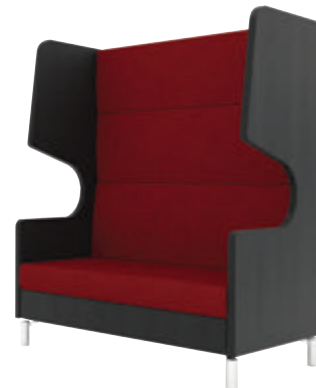
CH-HUME-02 1290W x 730D x 1500H mm