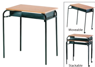
WK-E0011 700W x 500D x 760H mm