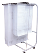
1. PLAN HANGER STAND

TR-PHS188 630D x 460W x 1450H mm TR-PHS288 660D x 654W x 1450H mm TR-PHS388 630D x 970W x 1450H mm