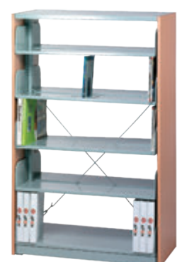
ST-E0113 951W x 521D x 1524H mm ST-E0113A EXTENSION UNIT