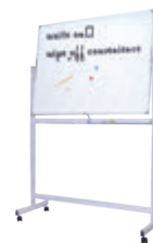
3. WHITE BOARD C/W STAND

TR-SN 15 450H x 600W mm (1.5' x 2') TR-SN 22 600H x 600W mm (2' x 2') TR-SN 23 600H x 900W mm (2' x 3') TR-SN 24 600H x 1200W mm (2' x 4') TR-SN 33 900H x 900W mm (3' x 3') TR-SN 34 900H x 1200W mm (3' x 4') TR-SN 35 900H x 1500W mm (3' x 5') TR-SN 36 900H x 1800W mm (3' x 6') TR-SN 44 1200H x 1200W mm (4' x 4') TR-SN 45 1200H x 1500W mm (4' x 5') TR-SN 46 1200H x 1800W mm (4' x 6') TR-SN 48 1200H x 2400W mm (4' x 8') TR-SN 410 1200H x 3000W mm (4' x 10') TR-SN 412 1200H x 3600W mm (4' x 12')