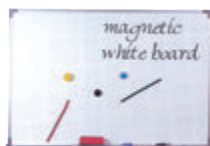
1. MAGNETIC WHITE BOARD

TR-SM 15 450H x 600W mm (1.5' x 2') TR-SM 22 600H x 600W mm (2' x 2') TR-SM 23 600H x 900W mm (2' x 3') TR-SM 24 600H x 1200W mm (2' x 4') TR-SM 33 900H x 900W mm (3' x 3') TR-SM 34 900H x 1200W mm (3' x 4') TR-SM 35 900H x 1500W mm (3' x 5') TR-SM 36 900H x 1800W mm (3' x 6') TR-SM 44 1200H x 1200W mm (4' x 4') TR-SM 45 1200H x 1500W mm (4' x 5') TR-SM 46 1200H x 1800W mm (4' x 6') TR-SM 48 1200H x 2400W mm (4' x 8') TR-SM 410 1200H x 3000W mm (4' x 10') TR-SM 412 1200H x 3600W mm (4' x 12')