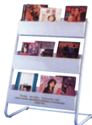
2. MAGAZINE RACK (3 POCKET)