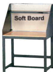
WK-E0135 910W x 610D x 1350H mm