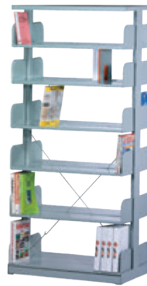
ST-E0116 915W x 521D x 1981H mm