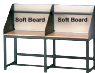
WK-E0136 1830W x 610D x 1350H mm