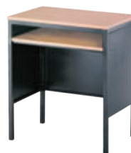
WK-E0018 700W x 500D x 760H mm