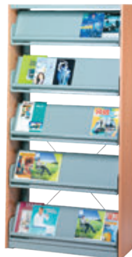
ST-E0123 951W x 394D x 1981H mm ST-E0123A EXTENSION UNIT