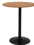
WK-MICA-04 700DIA x 1050H mm