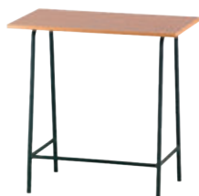
WK-E0002 700W x 500D x 760H mm