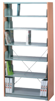
ST-E0117 951W x 521D x 1981H mm