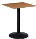
WK-MICA-01 600W x 600D x 760H mm