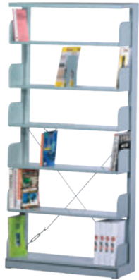
ST-E0114 915W x 318D x 1981H mm