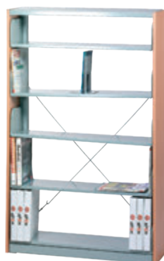
ST-E0111 951W x 318D x 1524H mm ST-E0111A EXTENSION UNIT