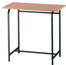
WK-E0001 700W x 500D x 760H mm