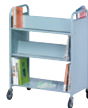
ST-E0124 800W x 432D x 1050H mm