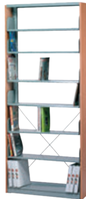
ST-E0119 951W x 318D x 2286H mm