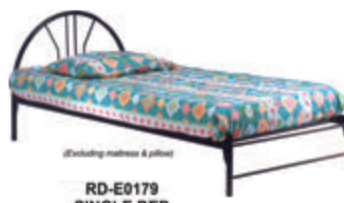
RD-E0179 SINGLE BED 940W x 1943D x 750H mm