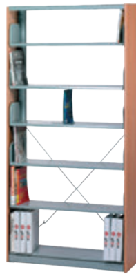
ST-E0115 951W x 318D x 1981H mm