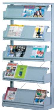
ST-E0122 915W x 394D x 1981H mm ST-E0122A EXTENSION UNIT