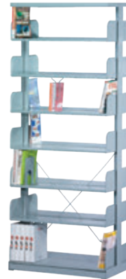
ST-E0120 915W x 521D x 2286H mm