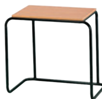
WK-E0005 700W x 500D x 760H mm