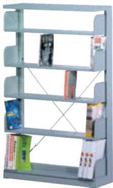
ST-E0110 915W x 318D x 1524H mm ST-E0110A EXTENSION UNIT