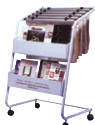
3. MOBILE NEWSPAPER MAGAZINE RACK