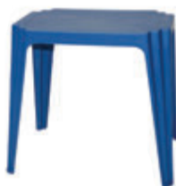
TR-E0022 815W x 500D x 700H mm