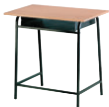
WK-E0009 700W x 500D x 760H mm