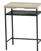
TR-E0021 600W x 450D x 760H mm