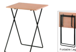
WK-E0007 700W x 500D x 760H mm