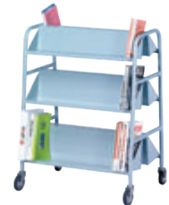
ST-E0125 820W x 508D x 1050H mm