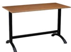
WK-MICA-03 1200W x 600D x 760H mm