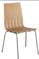
CH-MICA-01 442W x 420D x 860H mm