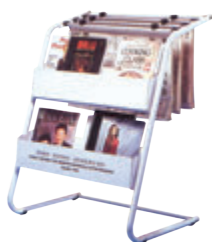
1. NEWSPAPER MAGAZINE RACK