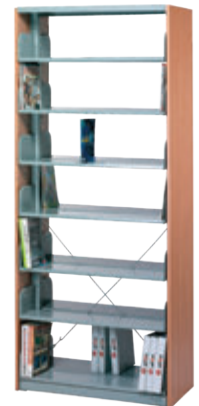
ST-E0121 951W x 521D x 2286H mm