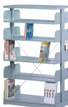
ST-E0112 915W x 521D x 1524H mm ST-E0112A EXTENSION UNIT