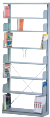
ST-E0118 915W x 318D x 2286H mm