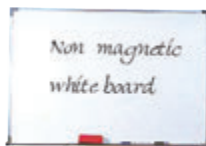
2. NON-MAGNETIC WHITE BOARD

TR-SN 15 450H x 600W mm (1.5' x 2') TR-SN 22 600H x 600W mm (2' x 2') TR-SN 23 600H x 900W mm (2' x 3') TR-SN 24 600H x 1200W mm (2' x 4') TR-SN 33 900H x 900W mm (3' x 3') TR-SN 34 900H x 1200W mm (3' x 4') TR-SN 35 900H x 1500W mm (3' x 5') TR-SN 36 900H x 1800W mm (3' x 6') TR-SN 44 1200H x 1200W mm (4' x 4') TR-SN 45 1200H x 1500W mm (4' x 5') TR-SN 46 1200H x 1800W mm (4' x 6') TR-SN 48 1200H x 2400W mm (4' x 8') TR-SN 410 1200H x 3000W mm (4' x 10') TR-SN 412 1200H x 3600W mm (4' x 12')