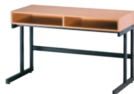
WK-E0024 1200W x 500D x 760H mm