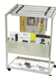
4. NEWSPAPER & MAGAZINE RACK BEIGE COLOUR