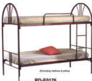
RD-E0176 DOUBLE DECKER BED 940H x 1943D x 1730H mm