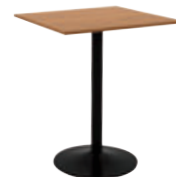
WK-MICA-05 600W x 600D x 1050H mm