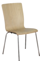
CH-MICA-02 420W x 420D x 855H mm