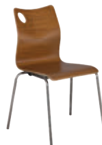
CH-MICA-03 370W x 450D x 790H mm