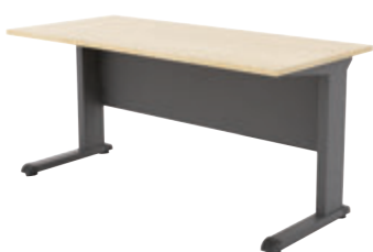
1. STRAIGHT MAIN TABLE

WK-TZ-MT 4 1200W x 740D x 760H MM WK-TZ-MT 5 1500W x 740D x 760H MM WK-TZ-MT 6 1800W x 740D x 760H MM