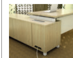
Wire management solution