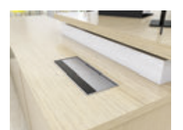
Flipper casing Size : 321W x 130D x 31H mm